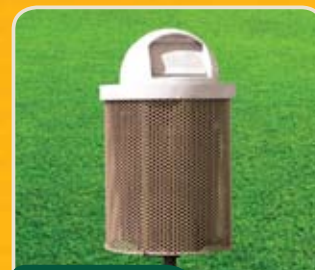
LITTER RECEPTACLE #1129J $580