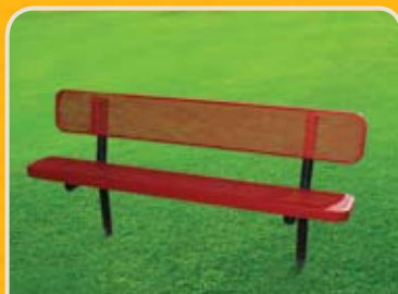
6' BENCH PERM #1266J $396