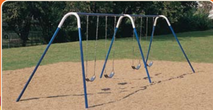
8' TOPRAIL SWING w/ 4 BELT SEATS MC #2917SJ $1,172