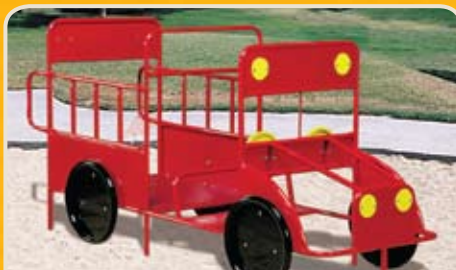
CLIMBER FIRE TRUCK #460-2J $1,808

Ground Space: 8' x 4' (2.4m x 1.2m) Protective Area: 21' x 16' (6.4m x 4.9m) Shipping Weight: 330 lbs.