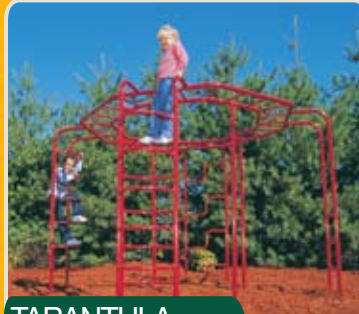
TARANTULA CLIMBER #456-1J $1,786