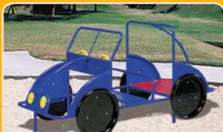
CLIMBER BEETLE #460-3J $1,480

Ground Space: 15' x 15' (4.6m x 4.6m) Protective Area: 28' x 28' (8.5m x 8.5m) Shipping Weight: 1,340 lbs. (608 kg)