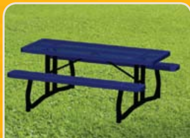
6' PICNIC TABLE #1116J $714

Ground Space: 10' x 4' (3m x 1.2m) Protective Area: 23' x 16' (7m x 4.9m) Shipping Weight: 430 lbs.