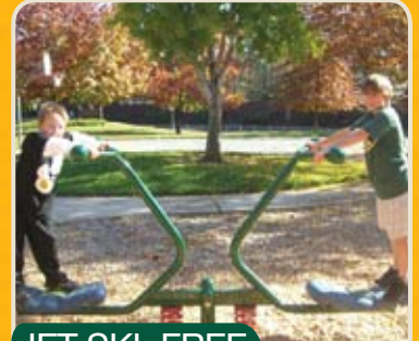
JET SKI® FREE RIDE #608-5J $1,987

Ground Space: 7' x 7' (2.1m x 2.1m) Protective Area: 19' x 19' (5.8m x 5.8m) Shipping Weight: 275 lbs.