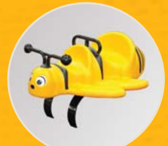
BUZZY BUMBLEBEE RIDER #961J $774

Ground Space: 5' x 3' (1.5m x .9m) Protective Area: 17' x 16' (5.2m x 4.9m) Shipping Weight: 245 lbs.