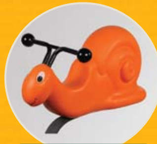
POKEY THE SNAIL #963J $521

Ground Space: 5' x 2' (1.5m x .6m) Protective Area: 18' x 17' (5.5m x 5.2m) Shipping Weight: 225 lbs.