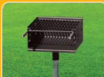
PARK GRILL #1104J $296