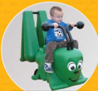
HOPPY THE GRASS-HOPPER #962J $768

Ground Space: 9' x 3' (2.7m x .9m) Protective Area: 24' x 15' (7.3m x 4.6m) Shipping Weight: 675 lbs.