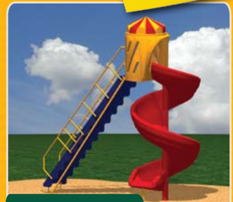
630° TYPHOON SLIDE #65-759J $4,654

Ground Space: 19' x 8' (5.8m x 2.4m) Protective Area: 32' x 21' (9.8m x 6.4m) Shipping Weight: 500 lbs.