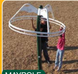
MAYPOLE #753J $1,607

Ground Space: 10' x 10' (3m x 3m) Protective Area: 22' x 22' (6.7m x 6.7m) Shipping Weight: 420 lbs.