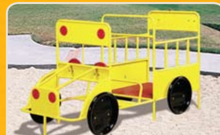
CLIMBER SCHOOL BUS #460-1J $1,808

Ground Space: 10' x 4' (3m x 1.2m) Protective Area: 23' x 16' (7m x 4.9m) Shipping Weight: 460 lbs.