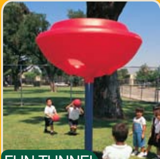
FUN TUNNEL #282-200J $697