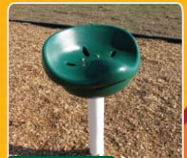
SADDLE SEAT #945-1J $436

Ground Space: 3' x 2' (.9m x .6m) Protective Area: 15' x 14' (4.6m x 4.3m) Shipping Weight: 65 lbs.