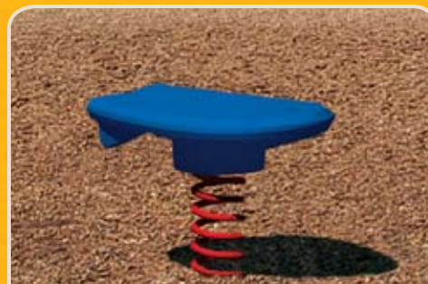
SURFER #946-1J $344