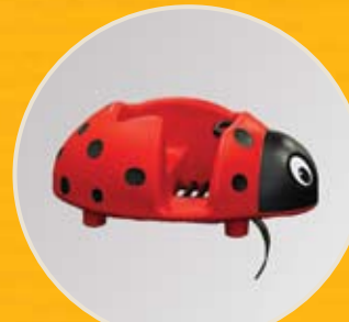
LUCKY THE LADYBUG #960J $874

Ground Space: 5' x 2' (1.5m x .6m) Protective Area: 17' x 15' (5.2m x 4.6m) Shipping Weight: 205 lbs.