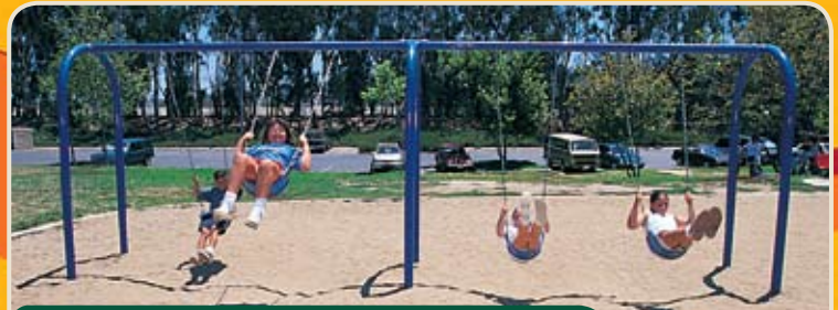
2 BAY ARCH SWING w/ 4 BELT SEATS & ANTI-WRAP #AW718-852-4SJ $1,807

Ground Space: 28' x 9' (8.5m x 2.7m) Protective Area: 41' x 32' (12.5m x 9.8m) Shipping Weight: 320 lbs.