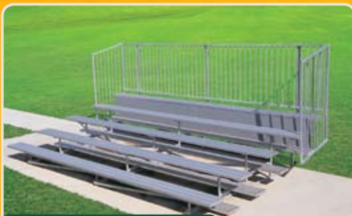
5 ROW BLEACHER -GALV #9894-1J $2,415

Ground Space: 5' x 4' (1.5m x 1.2m) Protective Area: 24' x 15' (7.3m x 4.6m) Shipping Weight: 340 lbs.