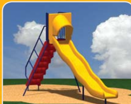
13' MOGUL SLIDE #65-726-6J $1,987

Ground Space: 13' x 7' (4m x 2.1m) Protective Area: 26' x 18' (7.9m x 5.5m) Shipping Weight: 410 lbs.