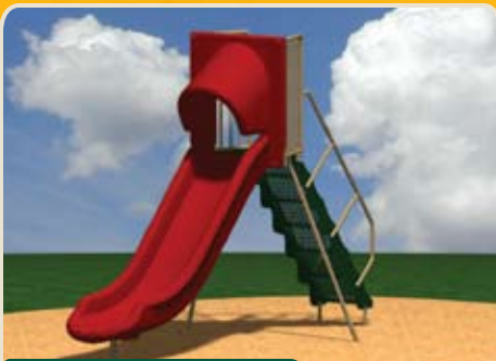
9' GROOVE SLIDE #65-638-5J $1,679