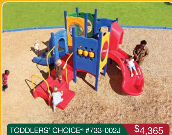
TODDLERS' CHOICE® #733-002J $4,365

Ground Space: 21' x 19' (6.4m x 5.8m) Protective Area: 34' x 32' (10.4m x 9.8m) Shipping Weight: 1,610 lbs. (730 kg)